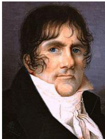
Former Viscount and Montagnard Paul Barras, who took part in the Thermidorian reaction and later headed the French Directory

The bloodshed did not end with the death of Robespierre; Southern France saw a wave of revenge killings, directed against alleged Jacobins, Republican officials and Protestants. Although the victors of Thermidor asserted control over the Commune by executing their leaders, some of those closely involved in the "Terror" retained their positions. They included Paul Barras, later chief executive of the French Directory, and Joseph Fouché, director of the killings in Lyon who served as Minister of Police under the Directory, the Consulate and Empire. [136] Despite his links to Augustin Robespierre, military success in Italy meant Napoleon Bonaparte escaped censure. [137]