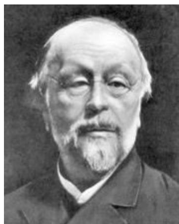
Hippolyte Taine, conservative historian of the French Revolution

The first writings on the French revolution were near contemporaneous with events and mainly divided along ideological lines. These included Edmund Burke's conservative critique Reflections on the Revolution in France (1790) and Thomas Paine's response Rights of Man (1791). [262] From 1815, narrative histories dominated, often based on first-hand experience of the revolutionary years. By the mid-nineteenth century, more scholarly histories appeared, written by specialists and based on original documents and a more critical assessment of contemporary accounts. [263]