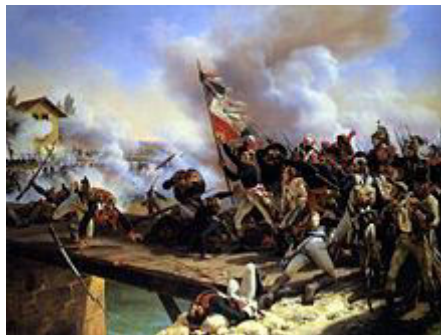
Napoleon's Italian campaigns reshaped the map of Italy

the expiration of the 12-month term for the 1792 recruits forced the French to relinquish their conquests. In August, new conscription measures were passed and by May 1794 the French army had between 750,000 and 800,000 men. [186] Despite high rates of desertion, this was large enough to manage multiple internal and external threats; for comparison, the combined Prussian-Austrian army was less than 90,000. [187]