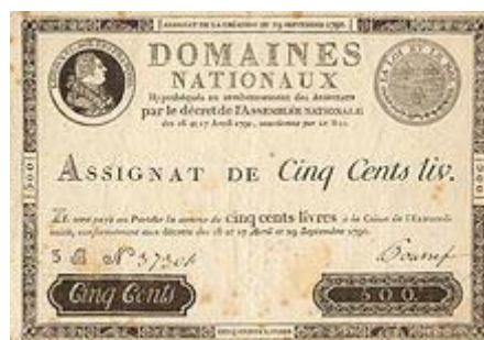
Early Assignat of 29 September 1790: 500 livres

The Revolution abolished many economic constraints imposed by the Ancien Régime, including church tithes and feudal dues although tenants often paid higher rents and taxes. [224] All church lands were nationalised, along with those owned by Royalist exiles, which were used to back paper currency known as assignats, and the feudal guild system eliminated. [225] It also abolished the highly inefficient system of tax farming, whereby private individuals would collect taxes for a hefty fee. The government seized the foundations that had been set up (starting in the 13th century) to provide an annual stream of revenue for hospitals, poor relief, and education. The state sold the lands but typically local authorities did not replace the funding and so most of the nation's charitable and school systems were massively disrupted. [226]