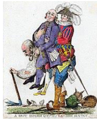
Caricature of the Third Estate carrying the First Estate (clergy) and the Second Estate (nobility) on its back

The Estates-General contained three separate bodies, the First Estate representing 100,000 clergy, the Second the nobility, and the Third the "commons". [34] Since each met separately, and any proposals had to be approved by at least two, the First and Second Estates could outvote the Third despite representing less than 5% of the population. [29]