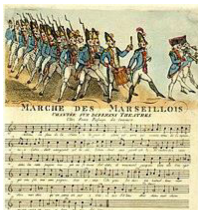
Marche des Marseillois, 1792, satirical etching, London [209]

To illustrate the differences between the new Republic and the old regime, the leaders needed to implement a new set of symbols to be celebrated instead of the old religious and monarchical symbols. To this end, symbols were borrowed from historic cultures and redefined, while those of the old regime were either destroyed or reattributed acceptable characteristics. These revised symbols were used to instil in the public a new sense of tradition and reverence for the Enlightenment and the Republic. [208]