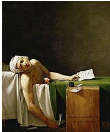
The Death of Marat by Jacques-Louis David (1793)

Growing discontent allowed the clubs to mobilise against the Girondins. Backed by the Commune and elements of the National Guard, on 31 May they attempted to seize power in a coup. Although the coup failed, on 2 June the convention was surrounded by a crowd of up to 80,000, demanding cheap bread, unemployment pay and political reforms, including restriction of the vote to the sans-culottes, and the right to remove deputies at will. [112] Ten members of the commission and another twenty-nine members of the Girondin faction were arrested, and on 10 June, the Montagnards took over the Committee of Public Safety. [113]