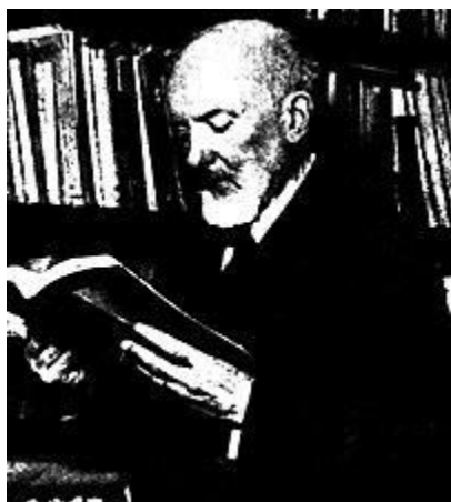
Georges Lefebvre, Marxist historian of the French Revolution

Dupuy identifies three main strands in nineteenth century historiography of the Revolution. The first is represented by reactionary writers who rejected the revolutionary ideals of popular sovereignty, civil equality, and the promotion of rationality, progress and personal happiness over religious faith. The second stream is those writers who celebrated its democratic, and republican values. The third were liberals like Germaine de Staël and Guizot, who accepted the necessity of reforms establishing a constitution and the rights of man, but rejected state interference with private property and individual rights, even when supported by a democratic majority. [264]