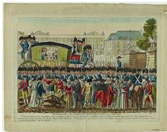
After the Flight to Varennes; the Royal family are escorted back to Paris

Held in the Tuileries Palace under virtual house arrest, Louis XVI was urged by his brother and wife to re-assert his independence by taking refuge with Bouillé, who was based at Montmédy with 10,000 soldiers considered loyal to the Crown. [84] The royal family left the palace in disguise on the night of 20 June 1791; late the next day, Louis was recognised as he passed through Varennes, arrested and taken back to Paris. The attempted escape had a profound impact on public opinion; since it was clear Louis had been seeking refuge in Austria, the Assembly now demanded oaths of loyalty to the regime, and began preparing for war, while fear of 'spies and traitors' became pervasive. [85]