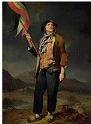
A sans-culotte and Tricoloure

Cockades were widely worn by revolutionaries beginning in 1789. They now pinned the blue-and-red cockade of Paris onto the white cockade of the Ancien Régime. Camille Desmoulins asked his followers to wear green cockades on 12 July 1789. The Paris militia, formed on 13 July, adopted a blue and red cockade. Blue and red are the traditional colours of Paris, and they are used on the city's coat of arms. Cockades with various colour schemes were used during the storming of the Bastille on 14 July. [215]