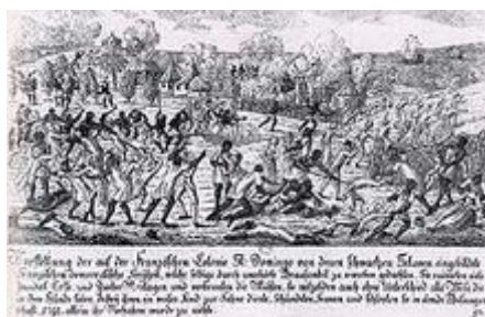
The Saint-Domingue slave revolt in 1791

In 1789, the most populous French colonies were Saint-Domingue (today Haiti), Martinique, Guadeloupe, the Île Bourbon (Réunion) and the Île de la France. These colonies produced commodities such as sugar, coffee and cotton for exclusive export to France. There were about 700,000 slaves in the colonies, of which about 500,000 were in Saint-Domingue. Colonial products accounted for about a third of France's exports. [191]