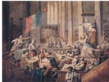
Club of patriotic women in a church