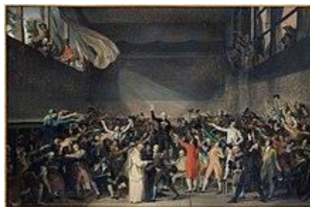
Le Serment du Jeu de paume by Jacques-Louis David (c. 1791), depicting the Tennis Court Oath

On 5 May 1789, the Estates-General convened at Versailles. Necker outlined the state budget and reiterated the king's decision that each estate should decide on which matters it would agree to meet and vote in common with the other estates. On the following day, each estate was to separately verify the credentials of their representatives. The Third Estate, however, voted to invite the other estates to join them in verifying all the representatives of the Estates-General in common and to agree that votes should be counted by head. Fruitless negotiations lasted to 12 June when the Third Estate began verifying its own members. On 17 June, the Third Estate declared itself to be the National Assembly of France and that all existing taxes were illegal. [42] Within two days, more than 100 members of the clergy had joined them. [43]