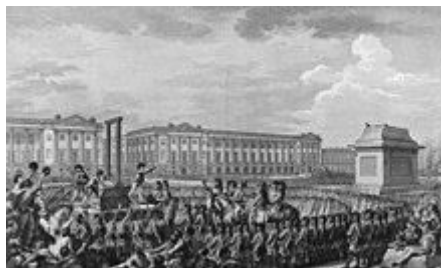
Execution of Louis XVI in the Place de la Concorde, facing the empty pedestal where the statue of his grandfather, Louis XV previously stood

In late August, elections were held for the National Convention. New restrictions on the franchise meant the number of votes cast fell to 3.3 million, versus 4 million in 1791, while intimidation was widespread. [102] The Brissotins now split between moderate Girondins led by Brissot, and radical Montagnards, headed by Robespierre, Georges Danton and Jean-Paul Marat. While loyalties constantly shifted, voting patterns suggest roughly 160 of the 749 deputies can generally be categorised as Girondists, with another 200 Montagnards. The remainder were part of a centrist faction known as La Plaine, headed by Bertrand Barère, Pierre Joseph Cambon and Lazare Carnot. [103]