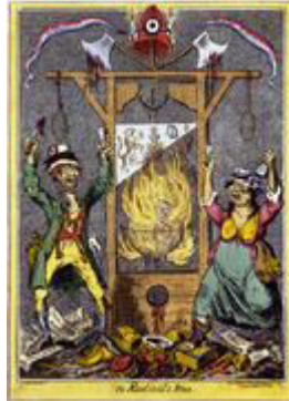
Cartoon attacking the excesses of the Revolution as symbolised by the guillotine

The guillotine remains "the principal symbol of the Terror in the French Revolution." [211] Invented by a physician during the Revolution as a quicker, more efficient and more distinctive form of execution, the guillotine became a part of popular culture and historic memory. It was celebrated on the left as the people's avenger, for example in the revolutionary song La guillotine permanente , [212] and cursed as the symbol of the Terror by the right. [213]