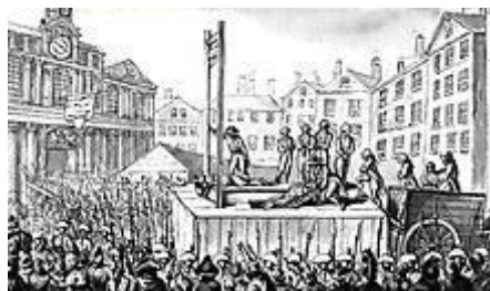
Nine émigrés are executed by guillotine, 1793

Although intended to bolster revolutionary fervour, the Reign of Terror rapidly degenerated into the settlement of personal grievances. At the end of July, the Convention set price controls on a wide range of goods, with the death penalty for hoarders. On 9 September, 'revolutionary groups' were established to enforce these controls, while the Law of Suspects on 17th approved the arrest of suspected "enemies of freedom". This initiated what has become known as the "Terror". From September 1793 to July 1794, around 300,000 were arrested, [118] with some 16,600 people executed