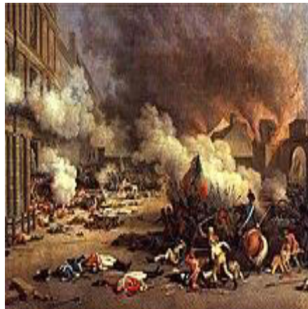
The storming of the Tuileries Palace, 10 August 1792

Although a minority in the Assembly, control of key committees allowed the Brissotins to provoke Louis into using his veto. They first managed to pass decrees confiscating émigré property, and threatening them with the death penalty. [94] This was followed by measures against non-juring priests, whose opposition to the Civil Constitution led to a state of near civil war in southern France, which Barnave tried to defuse by relaxing the more punitive provisions. On 29 November, the Assembly approved a decree giving refractory clergy eight days to comply, or face charges of 'conspiracy against the nation', an act opposed even by Robespierre. [95] When Louis vetoed both, his opponents were able to portray him as opposed to reform in general. [96]