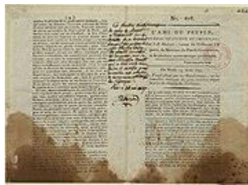
A copy of L'Ami du peuple stained with the blood of Marat

Newspapers and pamphlets played a central role in stimulating and defining the Revolution. Prior to 1789, there have been a small number of heavily censored newspapers that needed a royal licence to operate, but the Estates-General created an enormous demand for news, and over 130 newspapers appeared by the end of the year. Among the most significant were Marat's L'Ami du peuple and Elysée Loustallot's Revolutions de Paris [fr]. [204] Over the next decade, more than 2,000 newspapers were founded, 500 in Paris alone. Most lasted only a matter of weeks but they became the main communication medium, combined with the very large pamphlet literature. [205]