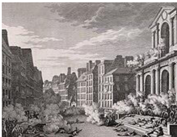
Troops under Napoleon fire on Royalist insurgents in Paris, 5 October 1795

Jacobin sympathisers viewed the Directory as a betrayal of the Revolution, while Bonapartists later justified Napoleon's coup by emphasising its corruption. [147] The regime also faced internal unrest, a weak economy, and an expensive war, while the Council of 500 could block legislation at will. Since the Directors had no power to call new elections, the only way to break a deadlock was rule by decree, or use force. As a result, the Directory was characterised by "chronic violence, ambivalent forms of justice, and repeated recourse to heavy-handed repression." [148]