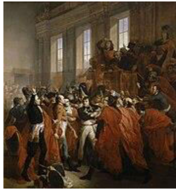
Napoléon Bonaparte in the Council of 500 during 18 Brumaire, 9 November 1799

With Royalists apparently on the verge of power, Republicans attempted a pre-emptive coup on 4 September. Using troops from Napoleon's Army of Italy under Pierre Augereau, the Council of 500 was forced to approve the arrest of Barthélemy, Pichegru and Carnot. The elections were annulled, sixty-three leading Royalists deported to French Guiana, and new laws passed against émigrés, Royalists and ultra-Jacobins. The removal of his conservative opponents opened the way for direct conflict between Barras, and those on the left. [155]