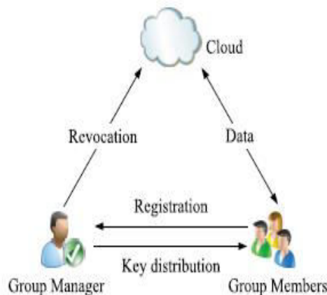
Fig. 1. System model.

We consider a cloud computing architecture by combining with an example that a company uses a cloud to enable its staffs in the same group or department to share files. The system model consists of three different entities: the cloud, a group manager (i.e., the company manager), and a large number of group members (i.e., the staffs) as illustrated in Fig. 1.